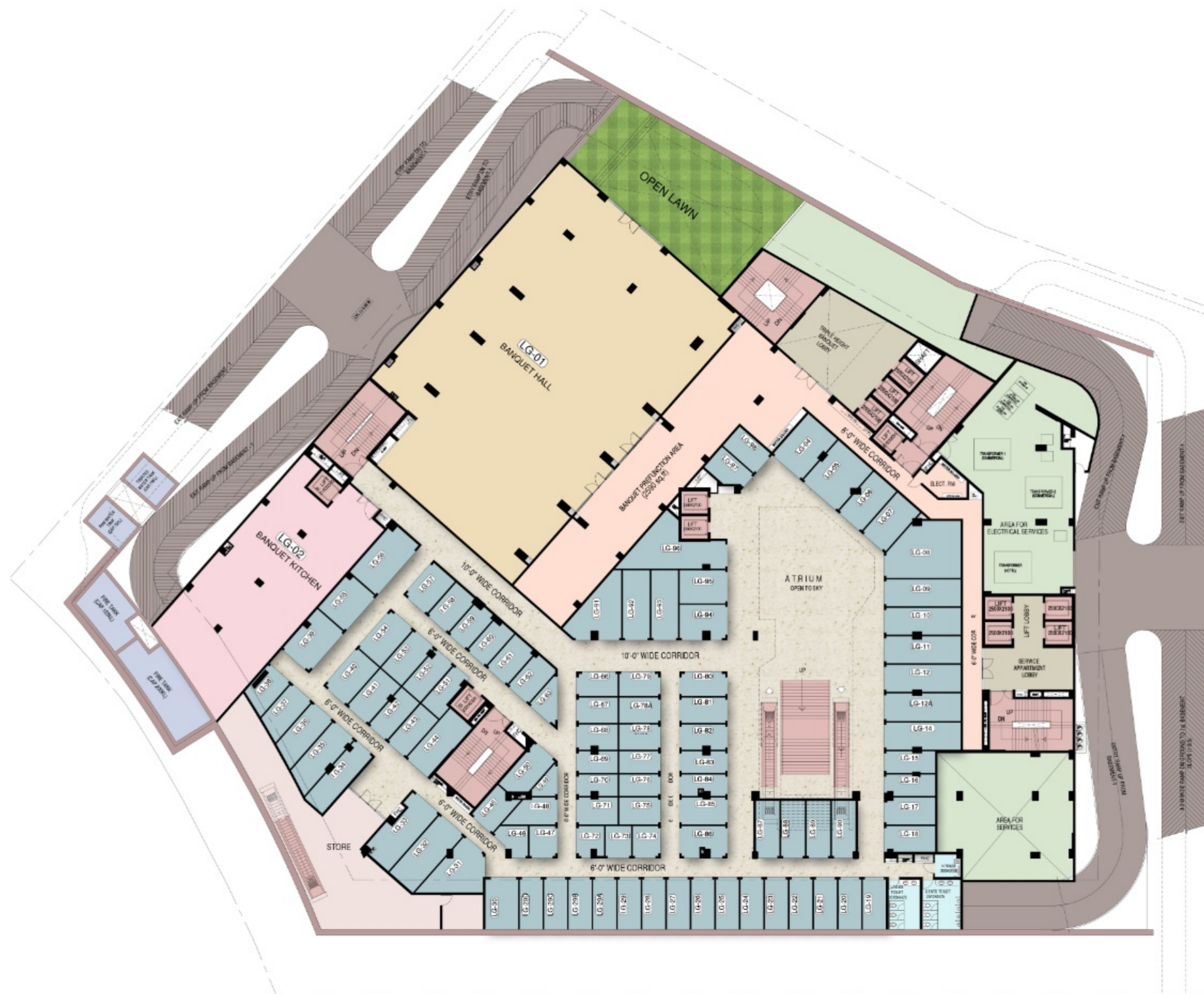
LOWER GROUND FLOOR PLAN